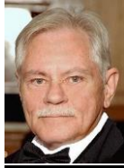
FROM THE EAST